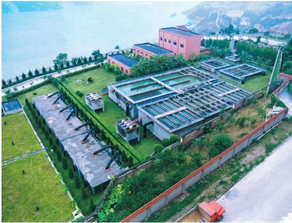
Water plant in Wushan County, Chongqing City

investments. Rural households, as beneficiaries of the projects, were responsible for 15% of the spending on the projects in the form of both monetary and labor input. Sufficient financial availability has ensured smooth implementation of the rural drinking water safety projects.