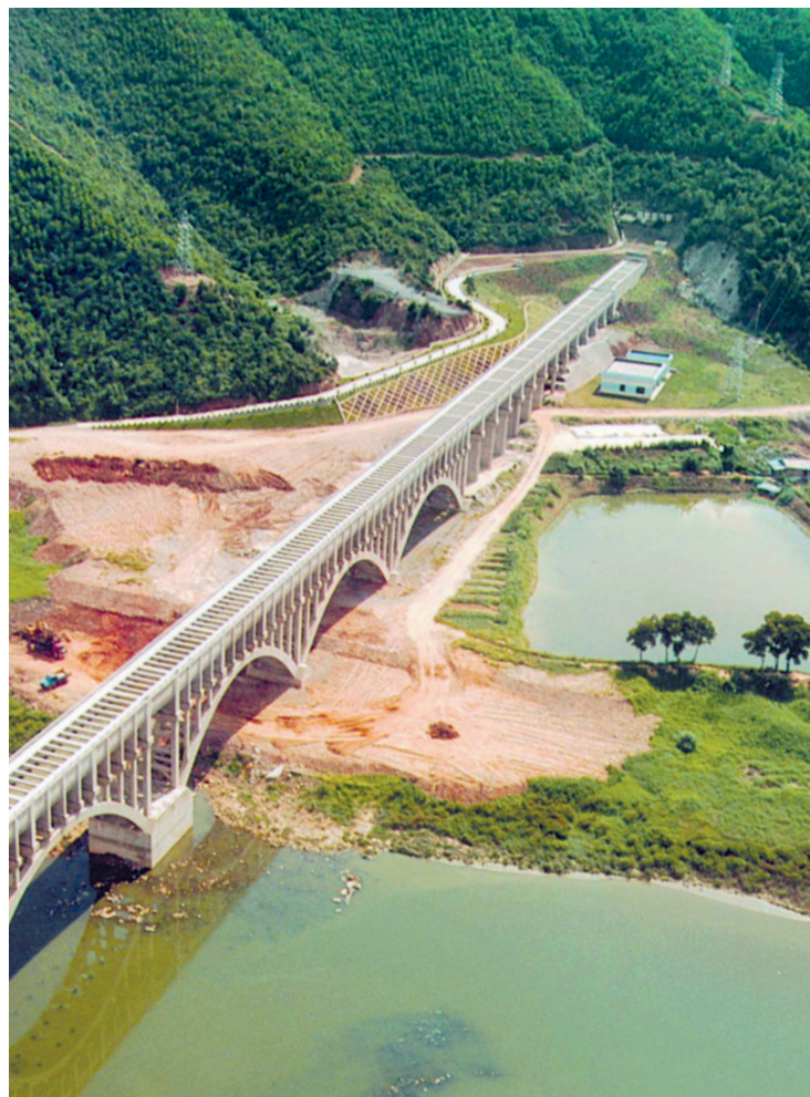
Dongshen Water Supply Project in Guangdong Province

The 2011 Decision on Accelerating Reform and Development of the Water Sector adopted, in explicit terms, a system of holding chief executives of regional governments accountable for access to safe drinking water. Local governments at all levels are required to treat drinking water safety projects as a key initiative of enormous relevance to people's livelihood. In 2013,