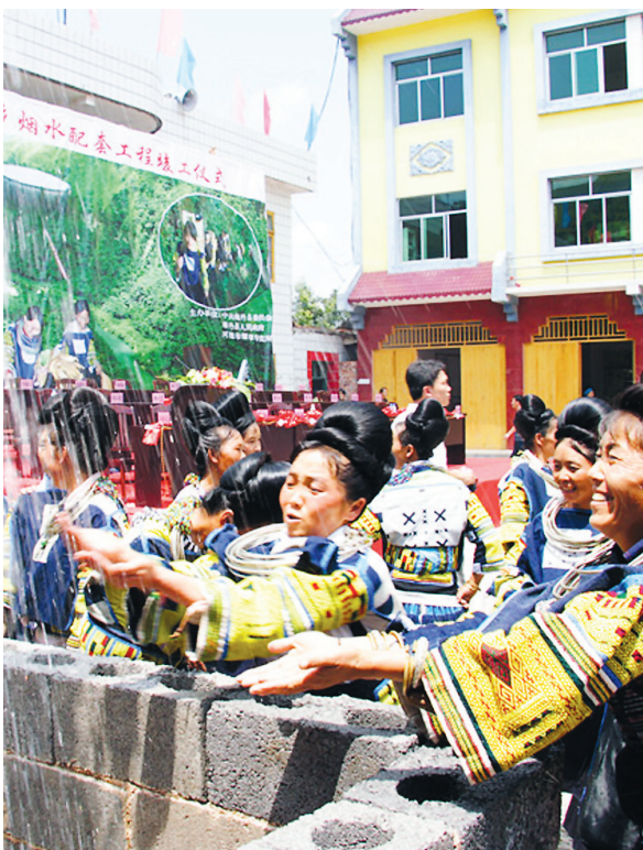
Drinking water supplied to Miao Ethnic Group

In November 2004, the Ministry of Water Resources (MWR) and the Ministry of Health (MOH) jointly issued the System of Indicators for Safety and Sanitation Evaluation of Rural Drinking Water , according to which, rural drinking water is assessed by the two grades of “safe” and “largely safe”. The system consists of four indicators: quality, quantity, level of convenience and assurance rates. As long as one of the four indicators stands below the lower end of the “safe” or “largely safe” range, the water in question cannot be considered as “safe” or “largely safe” drinking water.