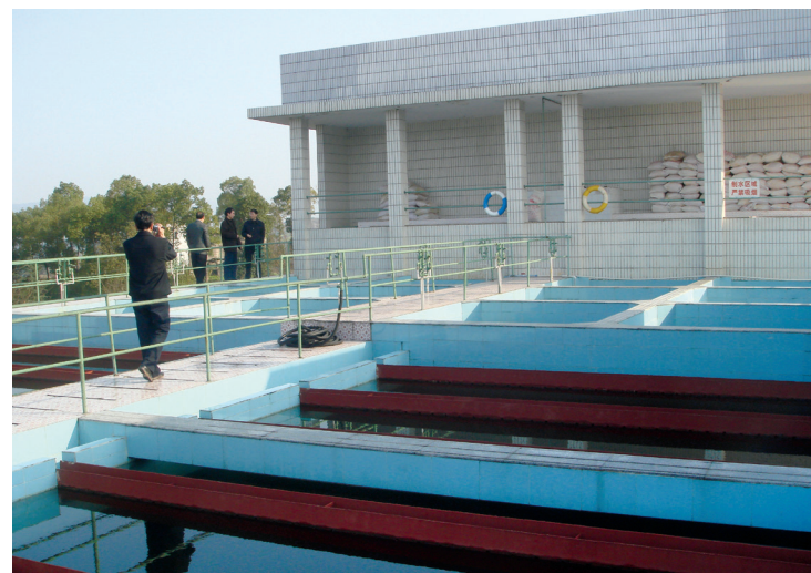
Safe drinking water supply project in Liangping County, Chongqing City

Specialized bodies are formed to manage larger-scale projects. Smaller water supply projects are collectively owned by the beneficiary villages or water users' cooperatives that the villages have formed. Operation and maintenance work is assigned to dedicated individuals. Distributed water supply projects are owned and managed by individual beneficiary farmers. Project operation and maintenance are primarily financed by water tariff. Any funding gap for project operation and maintenance is filled by subsidies from local governments or the village's collective coffers. In 2011, either on its own or in conjunction with NDRC, the Ministry of Land and Resources (MLR), the Ministry of Finance (MF) and the State Administration of Taxation (SAT), MWR issued the Circular on Appropriate Adjustment of Electricity Tariff , Circular on Land Management for Construction of Rural Drinking Water Safety Projects and Circular on Tax Policy for Construction and Operation of Rural Drinking