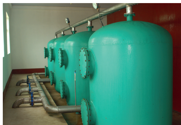
Water treatment facility in Liaozhong County, Liaoning Province

Water Safety Projects , which has helped reduce the cost of construction and operation of rural safe drinking water projects. To further enhance management and maintenance of rural safe drinking water works and ensure successful construction, effective management and long-term benefits of these works, MWR printed and distributed the Guiding Opinions on Further Enhancing Management and Maintenance of Rural Safe Drinking Water Works , requiring all concerned localities to take relevant measures for such enhancement.