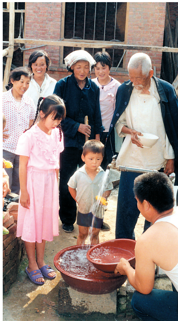
First-ever experience with tap water at farmers' home in Hebei Province

Since 2005, the central government has implemented the 2005-2006 Plan for Rural Drinking Water Safety Emergency Projects , 11th Five-Year Plan for Rural Drinking Water Safety Projects Nationwide and 12th Five-Year Plan for Rural Drinking Water Safety Projects Nationwide . A goal has been set to ensure access to safe drinking water for the rural population in its entirety by 2015.