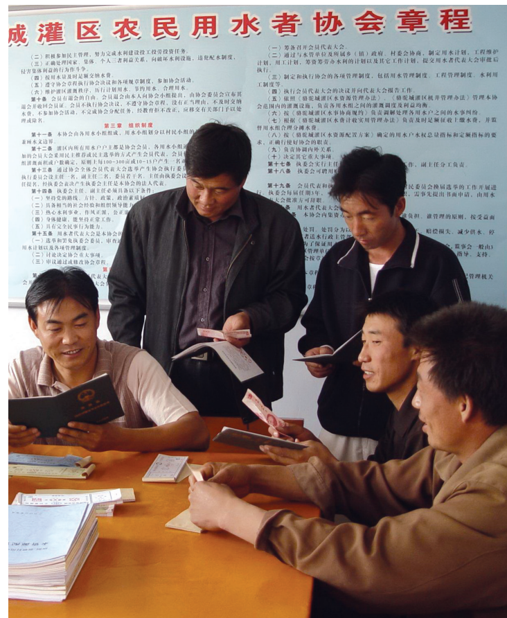
Water Users' Association established in Zhangye City, Gansu Province

First, the ratio of rural population with access to centralized water supply in China remains modest. Second, rural water supply projects are so costly that they have to be built with a low level of ambition. Some communities with limited availability of resources have to resort to decentralized water supply projects or only seek to serve a single village with one project. Third, rural water supply projects are plagued by small sizes and high cost of supply, which fails to be sufficiently covered by water tariffs. The difficulty in introducing specialized management poses a daunting challenge to the viability of project operation. Fourth, rural sources of drinking water are characterized by complexity of types, limited sizes and wide geographical distribution. Protection of water source areas remains a tough job. Fifth, rural drinking water safety projects lack technical and managerial expertise. Specialized management is elusive for the projects. In addition, more often than not, village and