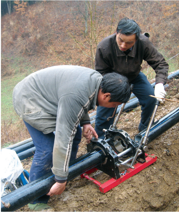
Water supply pipe installation in Sichuan Province

among existing rural drinking water projects.