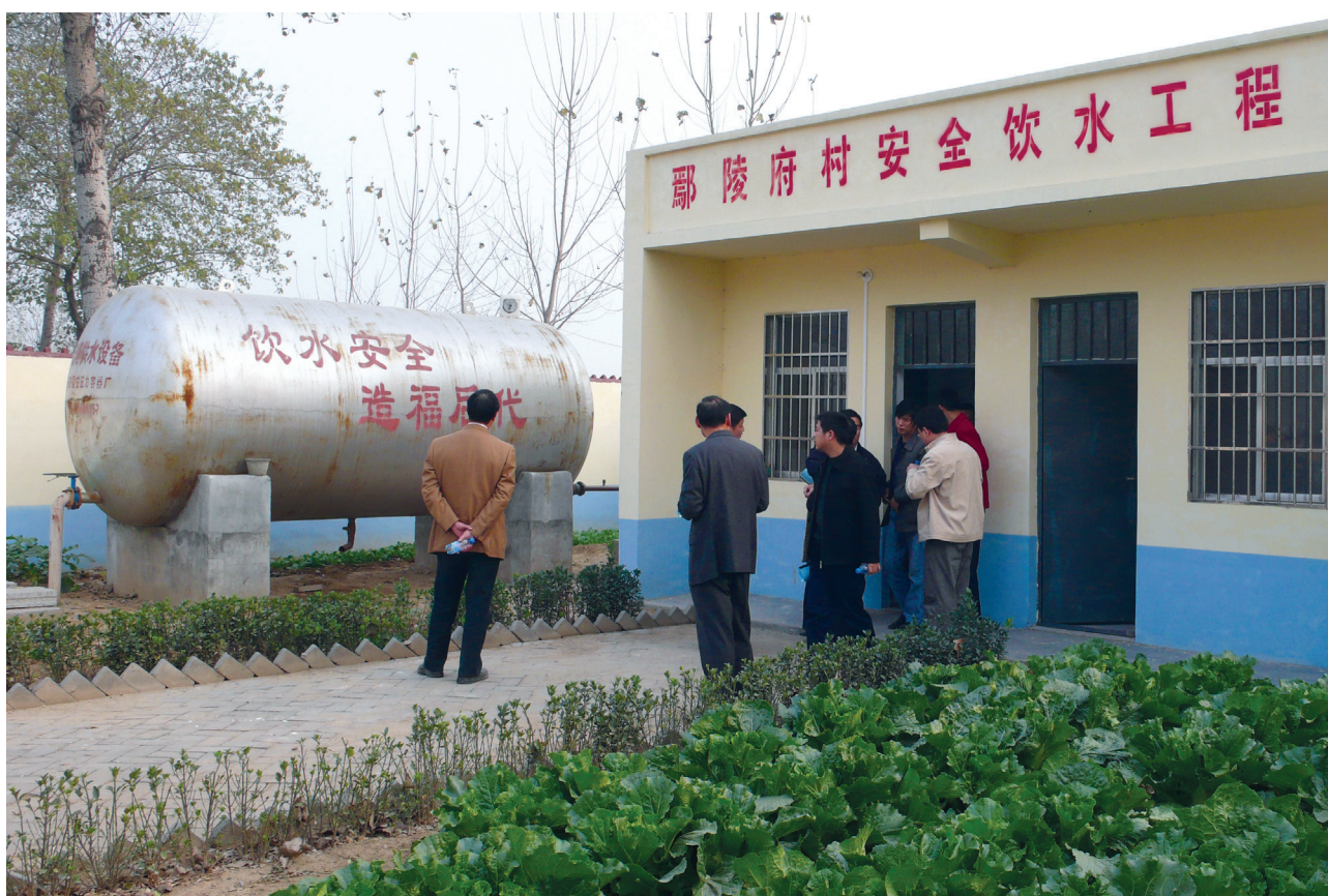
Safe drinking water supply project in Xinzheng City, Henan Province