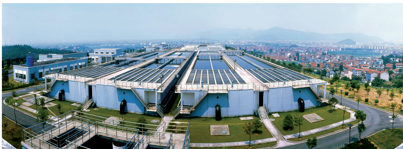
Chengnan Township Water Treatment Plant in Zhuji City, Zhejiang Province

In 2009, China met the goal of halving the ratio of the population without access to safe drinking water by 2015, attaining the concerned millennium development goal 6 years ahead of schedule. In 2009, China International Engineering Consulting Corporation (CIECC) undertook a mid-term review on the implementation of the 11th Five-Year Plan for rural drinking water safety via a survey involving 50,000 rural households. The findings showed a satisfaction ratio of up to 96% among the farmers. In 2000-2015, the government succeeded in providing access to safe